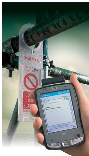
■ Safetrak electronic system

Every element of the T5 project has focused on developing innovative ways to eliminate hazards, inefficiencies and cost wastage. One example of innovation is the adoption of the Safetrak system by supplier, Stone Scaffolding.