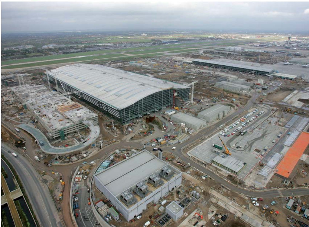
■ The 260 hectare T5 site

Heathrow is the world's busiest international airport. When its new Terminal 5 (T5) opens in March 2008, it is expected to handle around 30 million passengers a year.